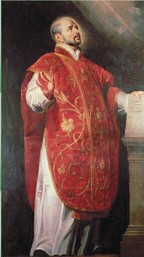
St Ignatius of Loyola 1491-1556 Founder, Society of Jesus